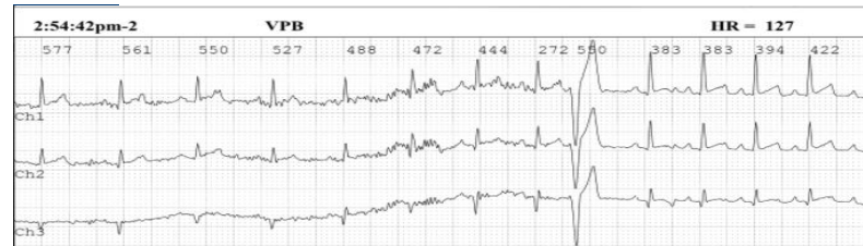
VPC with excitement